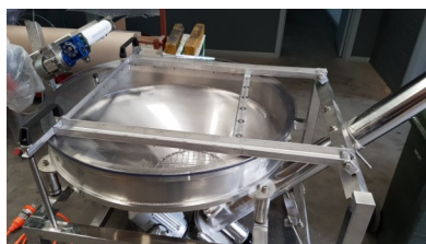
Option: Clear Polycarbon Lid